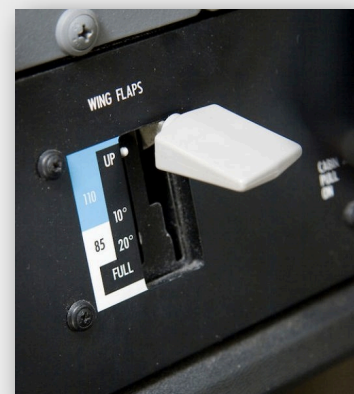
Human Factors Industry News 9

This was the pilot's third skydiving flight of the day. He performed a back taxi on the runway at the airport in Warrenton, Virginia, for takeoff. He reported that as he rotated the Pacific Aerospace 750XL for takeoff, he heard a "steady" stall warning horn, the flight controls felt mushy, and the airplane would not climb.